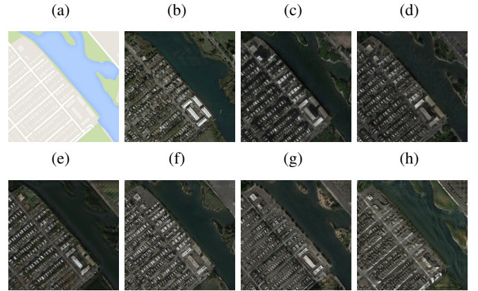
Fig. 3: Qualitative comparison of two I2I translation models for Maps \rightarrow Aerial photos transformation. (a) Input, (b) Ground-truth, (c) Cycle-GAN (100%), (d) Cycle-GAN (50%), (e) Cycle-GAN (10%), (f) NEGCUT (100%), (g) NEGCUT (50%) and (h) NEGCUT (10%).